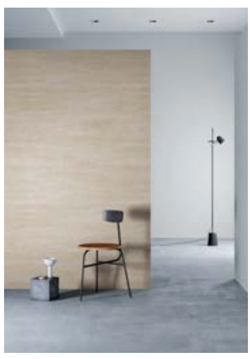
Product may vary in colour, texture, finish and scale

Product Characteristics Product Performance Stain Resistance Resistance to Solvents, Cleaners and other Chemicals Cleaning and Maintenance Application and Removal Adhesion Compatibility with Application Surfaces