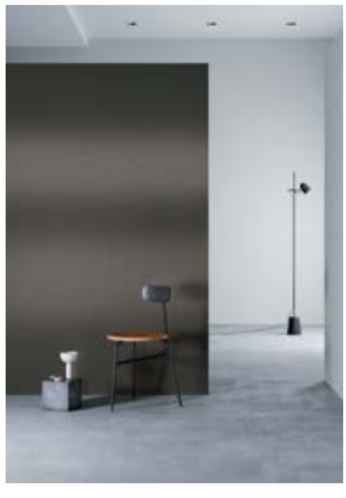
Product may vary in color, texture, finish and scale

Product Characteristics Product Performance Stain Resistance Resistance to Solvents, Cleaners and other Chemicals Cleaning and Maintenance Application and Removal Adhesion Compatibility with Application Surfaces