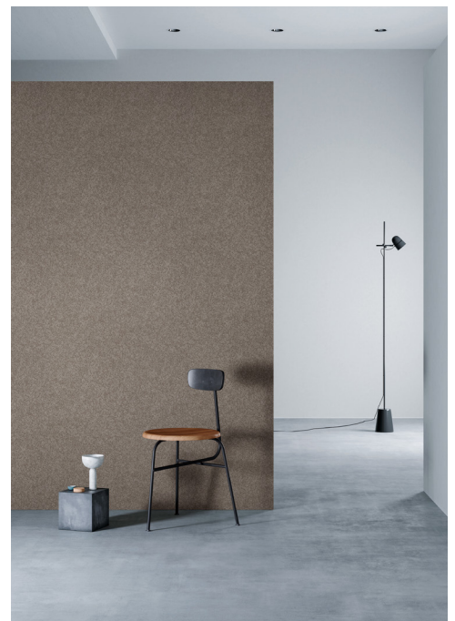
Product may vary in colour, texture, finish and scale