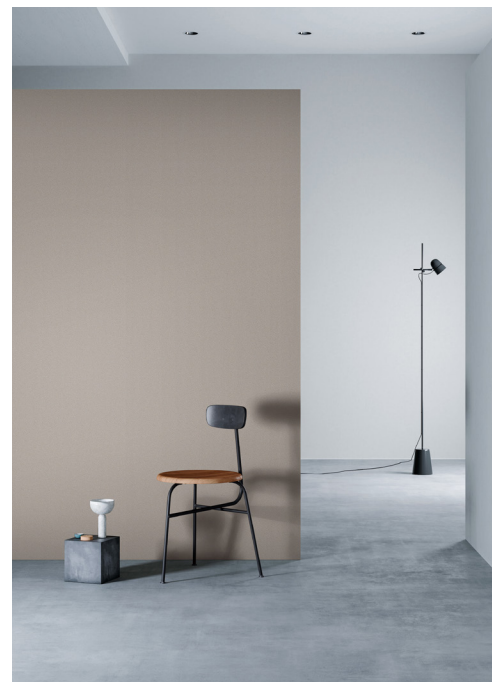
Product may vary in colour, texture, finish and scale