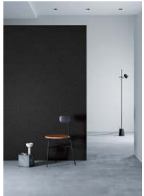
Product may vary in color, texture, finish and scale