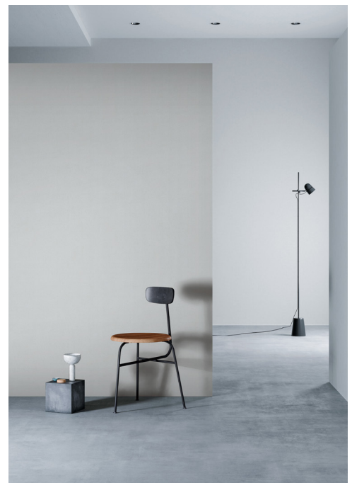
Product may vary in color, texture, finish and scale