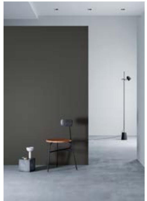
Product may vary in colour, texture, finish and scale